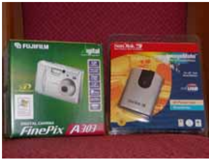
1st PRIZE Fujifilm A303 Digital Camera w/ ScanDisk Reader