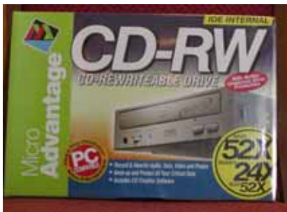
3rd PRIZE 52X MicroAdvantage CD Burner