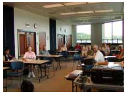
4th PRIZE One Year's Membership to LCACE