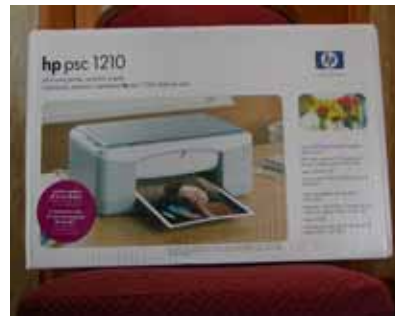
2nd PRIZE HP PSC 1210 Printer/Scanner/Copier