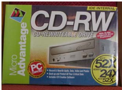
3rd PRIZE 52X MicroAdvantage CD Burner