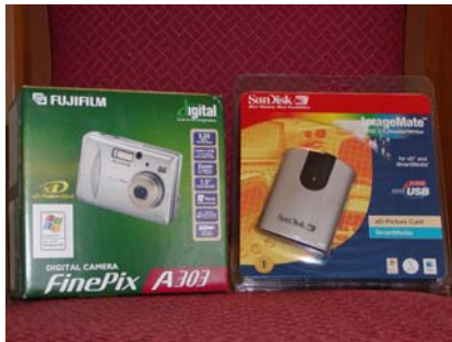
1st PRIZE Fujifilm A303 Digital Camera w/ ScanDisk Reader