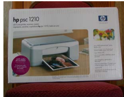
2nd PRIZE HP PSC 1210 Printer/Scanner/Copier