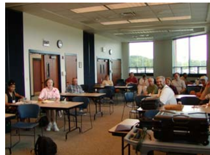
4th PRIZE One Year's Membership to LCACE