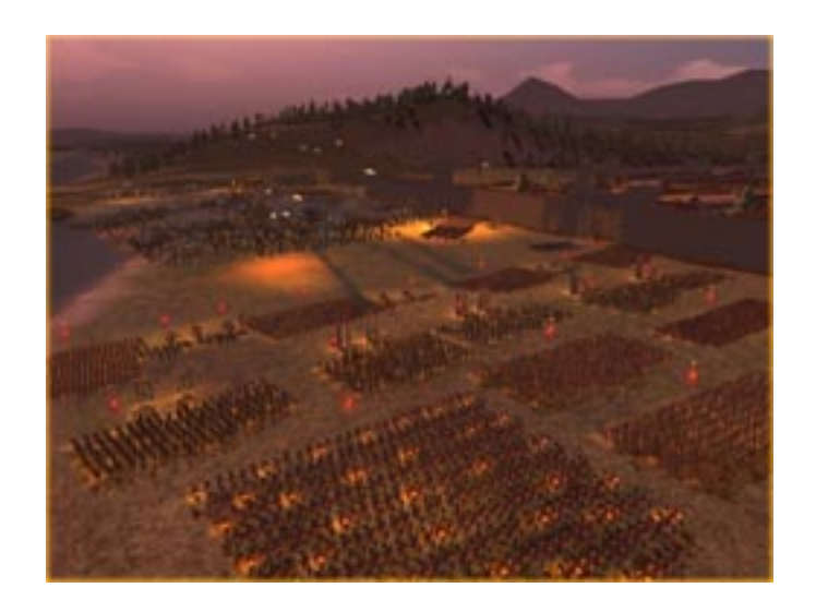
(Continued on page 8)

As for the aesthetics, it is really nice. You have armies that wade across a river now. That is cool. There are nighttime battles now, with torch carriers. The cinematics are nice. Generals can be recruited right now for the armies. They can be adopted by a faction family at anytime now. A faction does not need to hold a town/city for it to play. Most of the factions start as roaming nomads.