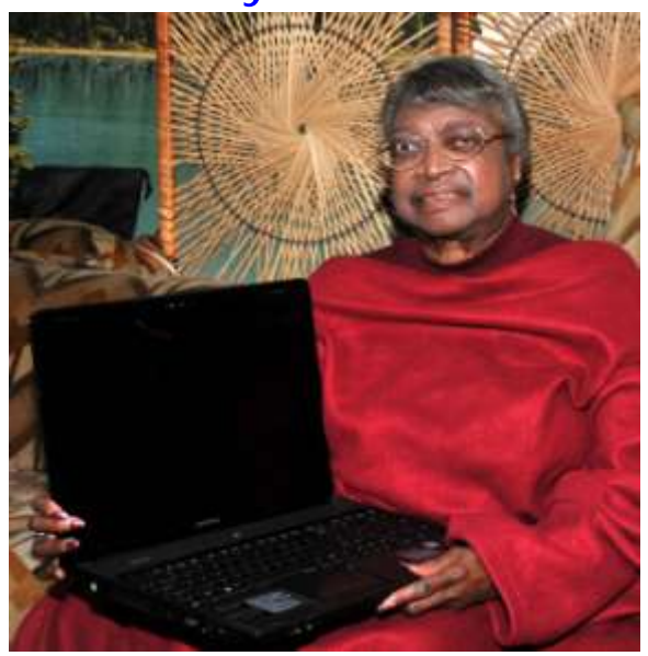
17" Compaq Presario Notebook