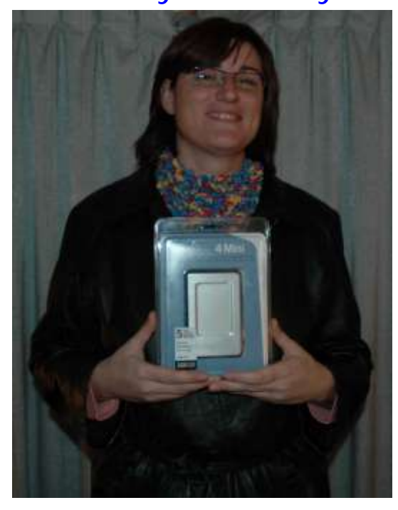
Maxtor One Touch 4 Mini 320GB hard drive