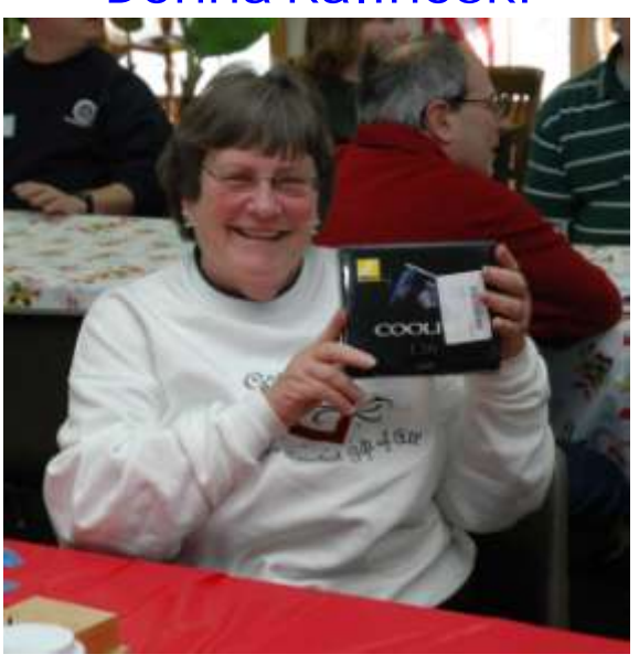
Nikon Coolpix L18 8 MP digital camera