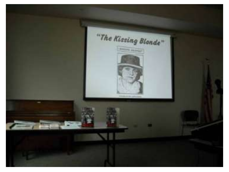
"Skeletons in our Closet: Researching a Family Scandal"