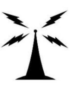
(Continued on page 7)

Wireless Internet and Hotspot services are ways the traveler can connect. Here in Canton, wireless is provided at no charge at all the public libraries and many business locations including Panera Bread, Starbucks, some of the McDonalds and the airport. If you live in downtown