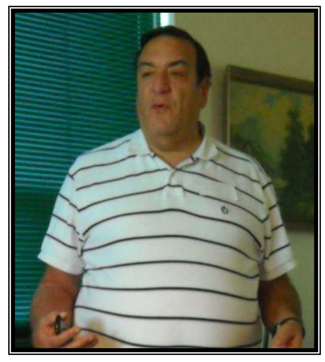
The last call was to a member in the audience. He/she (darn, I should have taken better

The third call was a video call to his younger son in Connecticut. We saw his show stealing granddaughter who was 20 months old that day. That call was computer to computer from his contact list. The call for the entire 5 minutes was completely FREE . Ahh! Do I hear angels singing?