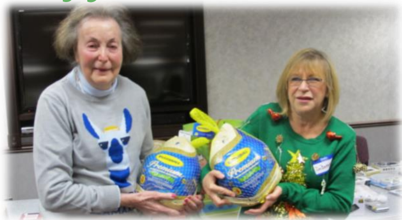
Ugliest Sweater Robin